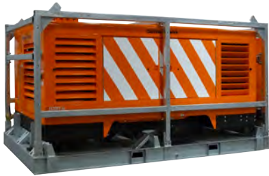
185 CFM to 1800 CFM OFF SHORE COMPRESSOR