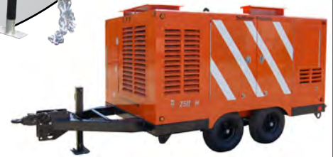
750 CFM to 900 CFM