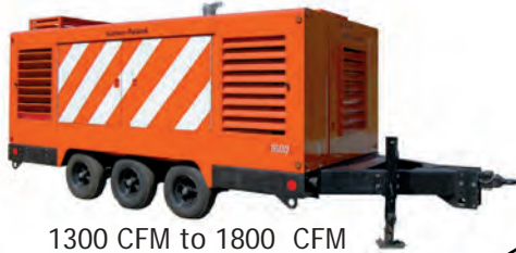
1300 CFM to 1800 CFM